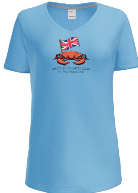
Port & Co. Women's Performance Blend V-Neck Tee