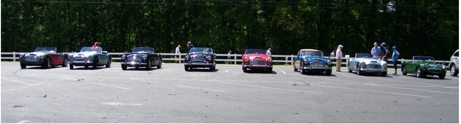
The Harrisburg Region's Spring Tour at Moonshine Church.

A fter meeting at the Grand Pooh-Bah's domicile for morning refreshments we set out on the regions frequently delayed Spring Tour. Historically, this event gets held closer to summer than spring and this year's tour was no exception. Our caravan set out on Saturday June 29th.