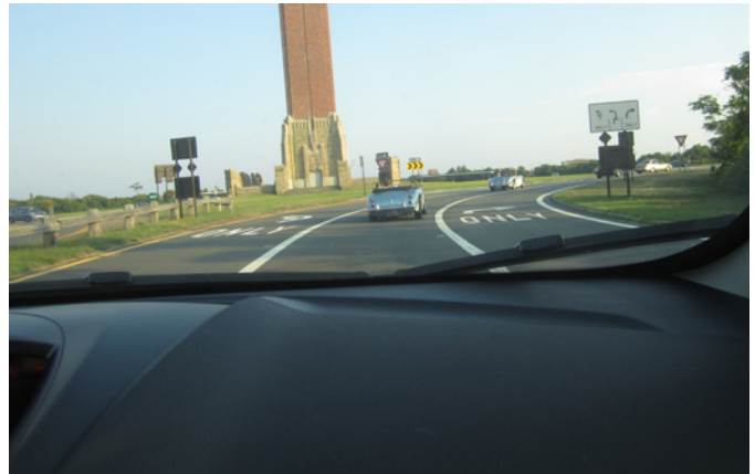
Healeys ready to circle Jones Beach Water Tower.

The event starts in two locations: Bellmore to the west and Oak Beach to the east. The Bellmore group joins the eastern contingent at Oak Beach and, after a half hour or 45 minutes of conversation, all move off for Fire Island. Once on the island, the caravan heads east towards the lighthouse and makes a U-turn to watch the sunset. Then off to eat. This year the owner of the restaurant provided us with complimentary pina colodas to cool off!