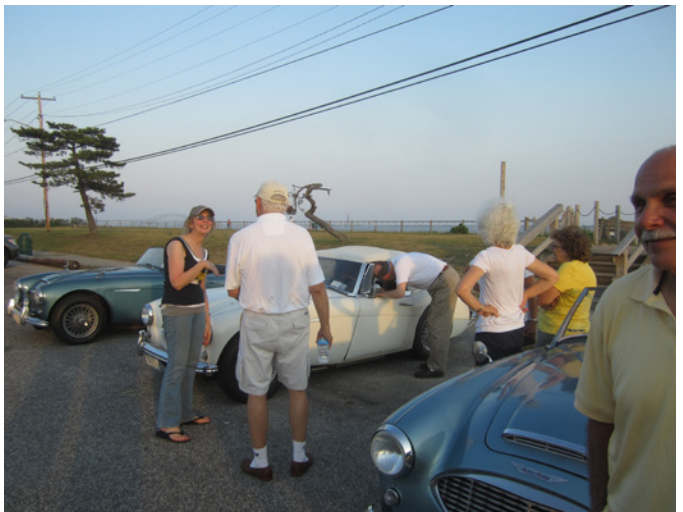
Always some good conversation!