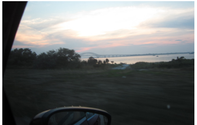
Sunset from Fire Island