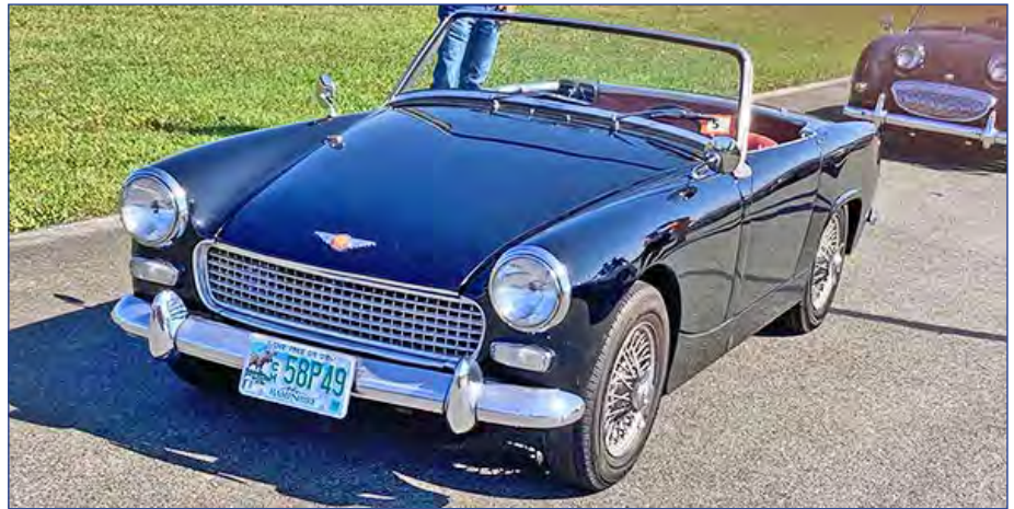
All spiffy at Enclave 2022

H ! This month's Sprite article is about my 1963 HAN7 Mk II Sprite. Mk II's are interesting because engineering-wise, they were and are the bridge vehicles between the Frog/Bugeyes and the "Modern, Sophisticated" Mk IIIs and IVs. They have the now familiar "square" bodies of the later Sprites but also have the running gear of the Frog/Bug including the quarter elliptic rear suspension as well as the windscreen and side curtains. Early Mk II's (HAN6) cars also retained the 948cc engine, the smooth case gearbox, mechanical tachometer, most of the dash and interior of the Frogs.