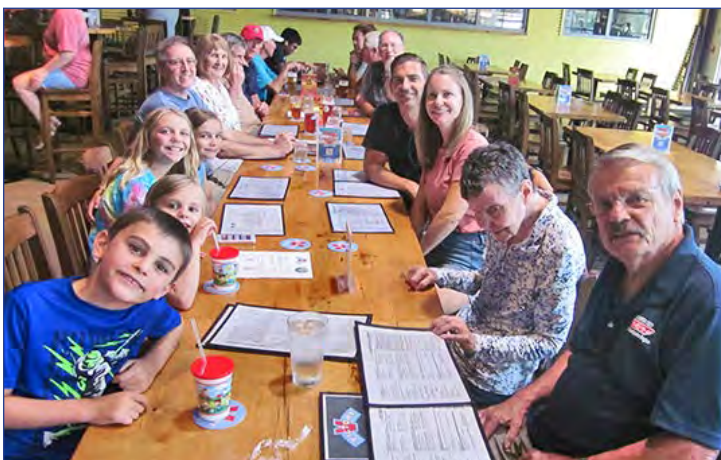
Lunch at Victory.