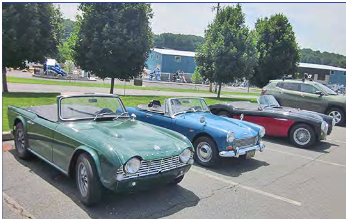
TR-4, Sprite, 100, Jeep at Victory Brewing Co.