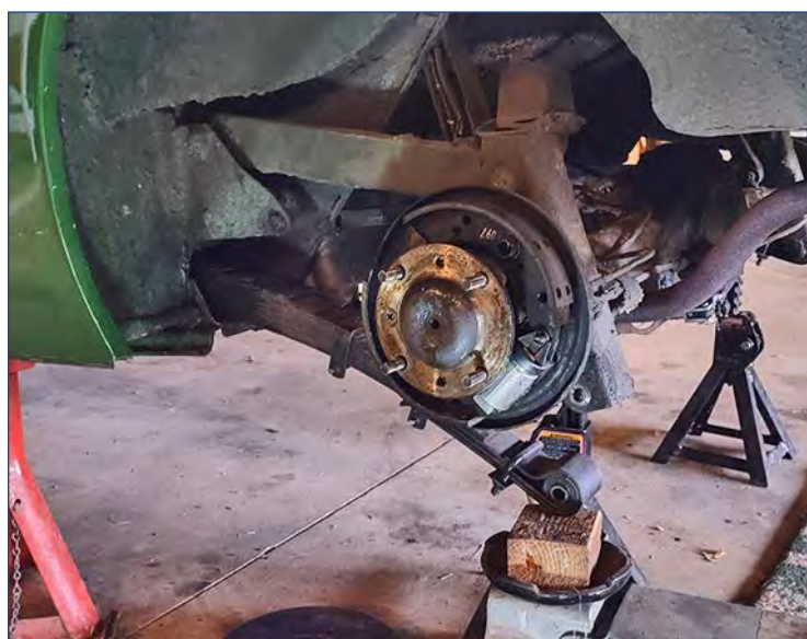
Installation is under way. Note the clever, but probably not fully approved use of a pump jack to lift springs.