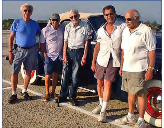
Old Healey men.