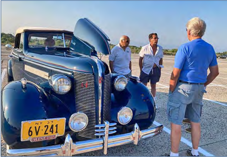
Just a little windy.