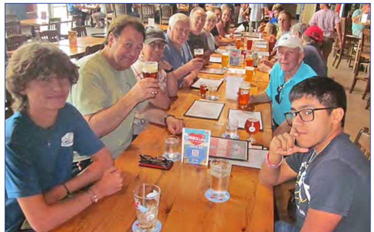
Lunch at Victory.