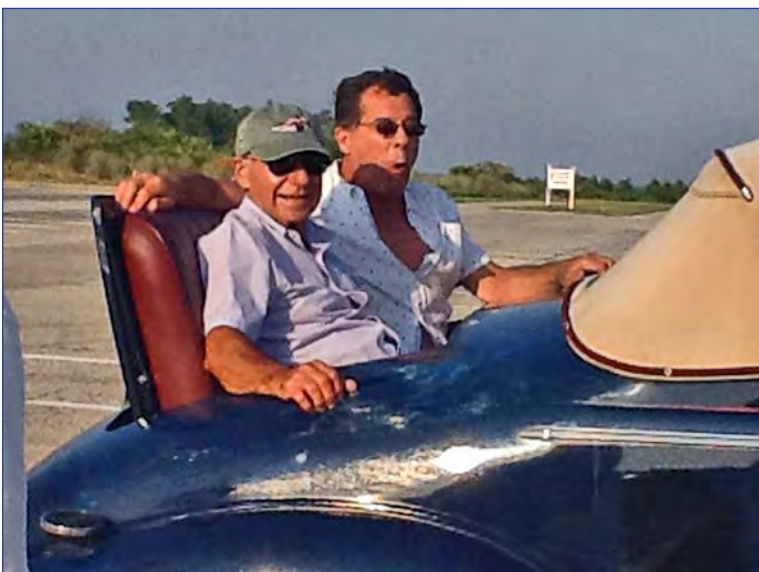
The rumble seat.