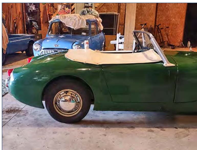
A little dark but note the more acceptable and normal ride height with the BCC original-type rear springs. I won't mention the other vehicle hiding in the corner.