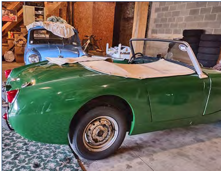
Unsightly ride height with the rally spec springs. Note a Mini is hiding in the background.