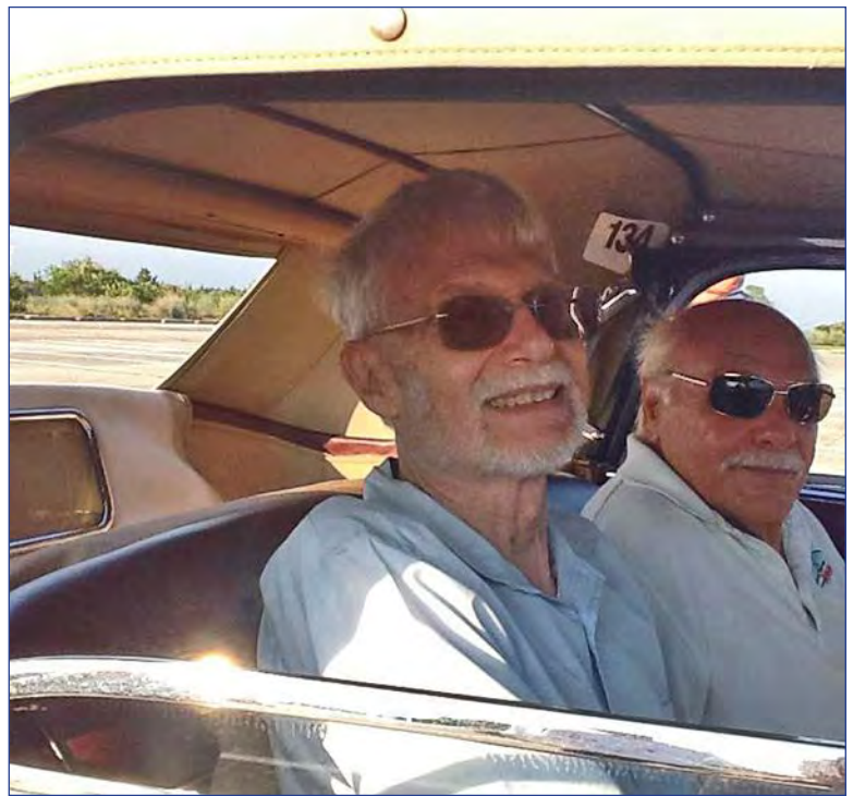
The only way to travel.