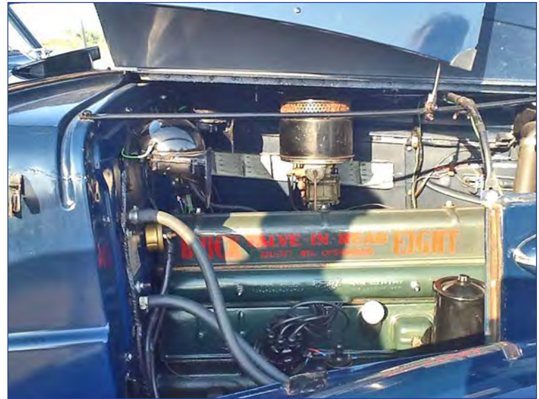
8 cylinders all in a row.