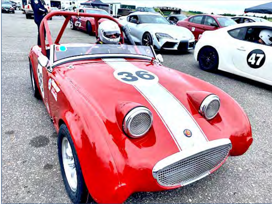
Sitting in the staging area NASA.

through 4. I selected NASA's date at Millville's New Jersey Motorsport Park for testing. I just wanted to run the car at speed to check power input and braking capabilities. The car attracted a lot of attention since most of the cars were ten-dollar modified Mazda Miatas and late model Toyotas and Porsches. NASA reminded me of what it must have been like in the early days of SCCA racing. Most drivers are younger men and women who drive their cars to the track, change a set of tires and go out and run hard.