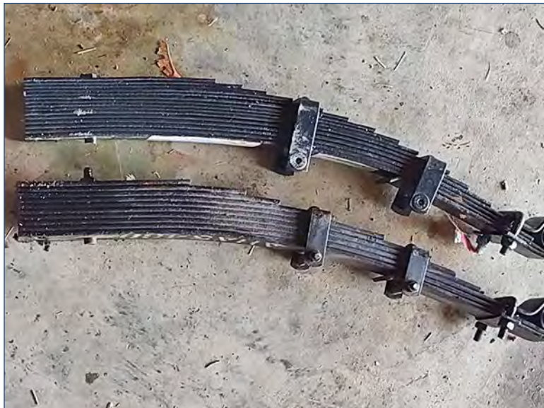
Spring comparison by vendor; BCC on top, Moss on bottom:

https://britishclassiccarsparts.com/products/frogeye-sprite-mk1-an5-rear-leaf-spring-set