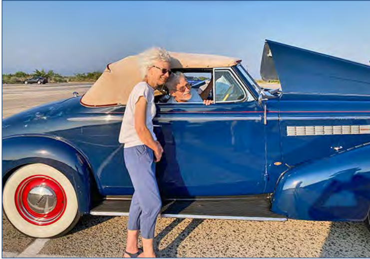
Young lady checks it out.

ride to the diner in it with Steve, something I had been looking forward to! No vibrations, quiet. According to Steve, it has the small straight 8; the larger engine is 4" longer. The engine has overhead valves as opposed to a flat head engine with valves in the block and to the side of the cylinders, also known as a side valve engine. Overhead valves were a big deal in 1937 but not all GM cars had them. Pontiac, a brand known for performance after WWII, had side valve engines until 1955. Chevrolet had overhead valves in their earliest "Blue Flame* six cylinders. That was a big selling point Steve's valve cover proudly proclaims, "overhead valves".