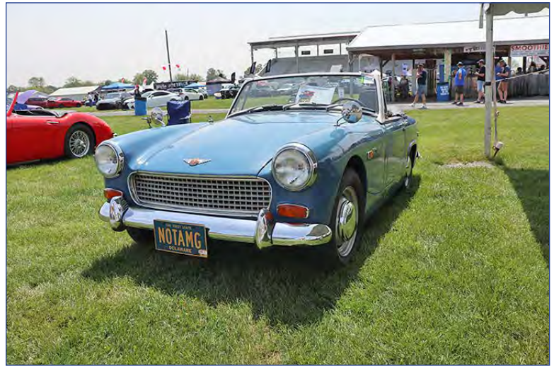
Chuck Ott's 1969 Sprite