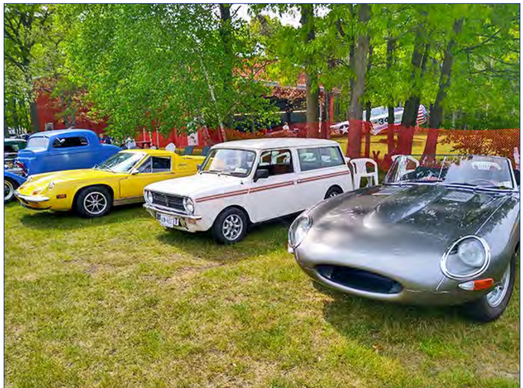
Frank's car next to late Mini with AT6 Texan behind the trees.