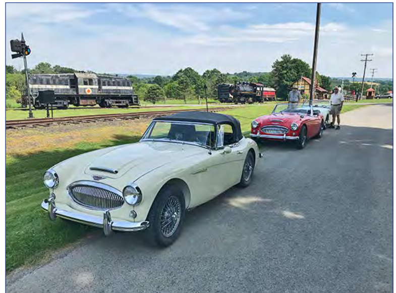
Fealey parked, Kunkle.