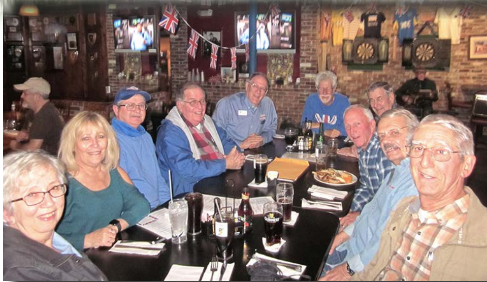
The Election Party at Stoney's British Pub.

H appy New Year to all of our members. Hopefully it will be free of the dreaded Covid-19 allowing us to enjoy outings and events with our friends and our Healeys.