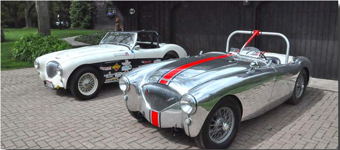
AHX 12 & AHX 14