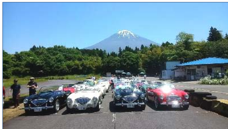
Healeys and Mount Fuji

If you haven't seen the Castrol film of the 1965 Targa Florio race in Sicily, "Mountain Legend", it is available on youtube. It is worth checking out - Timo Makinen in a big Healey, Paddy Hopkirk in a Midget, and Rauno Aaltonen in a Sprite. Makinen and Aaltonen were two of the "Flying Finns" that the BMC Competitions Department hired when they decided to go all out and win in international rallying and road racing. Paddy Hopkirk went on to found a very successful Mini after-market business. Now you can have fun passing the time with the links and suggestions above.