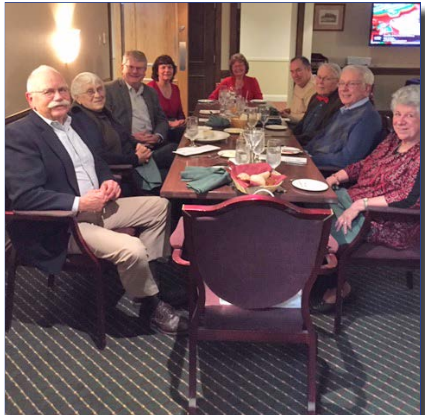
Lehigh Valley Region Holiday Party at Brookside.