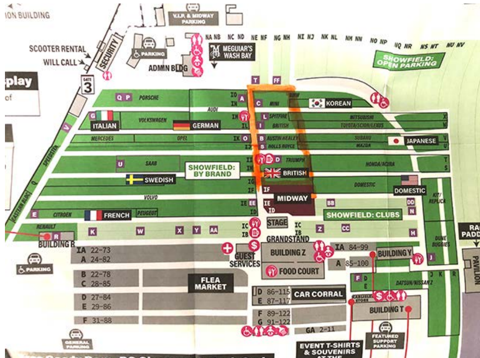
British car attendance has dropped such that they get a corner of a row.