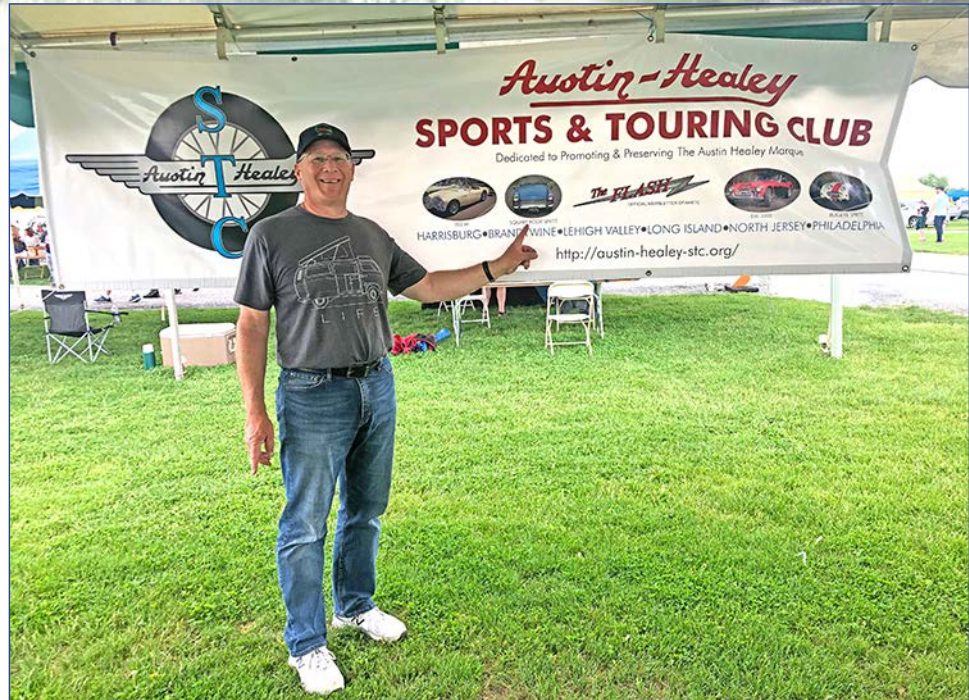
All of the Brandywine members at Import Carlisle. My Sprite was there (on the banner).

Also in May was the Carlisle Import Auto show. Usually we get a few Brandywine members attending this Harrisburg, PA area event. This year the weather forecast was an issue, it was calling for rain all day Friday, and also as of when I went to bed Friday night thunderstorms were forecast on Saturday. It turns out that the day was mostly dry on Friday. Then imagine my surprise when I checked the weather early Saturday morning and found that the forecast changed to cloudy, at least until 2pm. Since there was still a chance of rain, and because I drove the Sprite last year, I decided to jump in my trusty