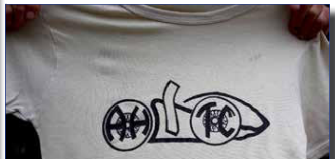
An old unusual AHSTC Design