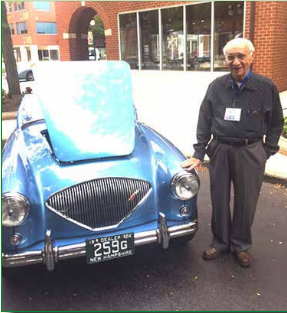
How many 100's do you see?

An interesting comment sent in from Ralph Scarfogliero who took this picture.